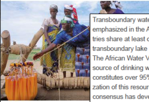
MANUEL DE FORMATION

Transboundary water management is of great importance to Africa as has been emphasized in the African Water Vision 2025; almost all Sub-Saharan African countries share at least one international river basin. In Africa there are about eighty transboundary lake and river basins and at least forty transboundary aquifer basins. The African Water Vision 2025 stresses that groundwater is the major, and often only, source of drinking water for more than 75 % of the African population. Groundwater constitutes over 95% of the fresh water resources in Africa, and pollution and salinization of this resource is often irreversible on human timescale. As a result, a broad consensus has developed in AMCOW and in ANBO/INBO, (African (International) Network of Basin Organizations), that groundwater must be included in integrated river basin management.